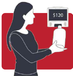
Product Info & Price Look Up

The SK-100 could be deployed for self-service and interactive applications including and not limited to: