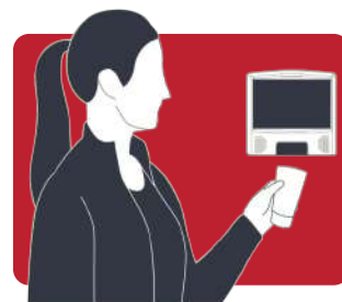
Product Ingredient Survey