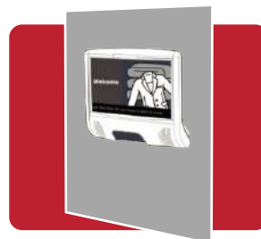
Digital Signage & Promotion